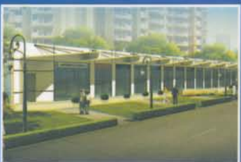
Mapsko Shopping Arcade Sec-82, Gurgaon (Haryana)