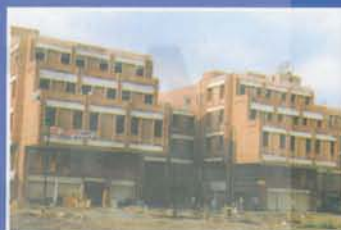
Apra Plaza Road No. 44 Pitam Pura, New Delhi