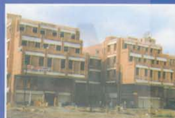
Apra Plaza Road No. 44 Pitam Pura, New Delhi