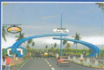
Mapsko Garden Estate, Sonapat