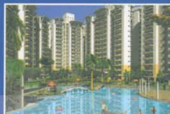
Krishna Apra Gardens, Indrapuram Ghaziabad