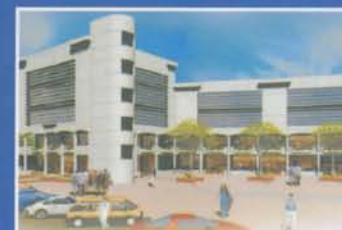
Krishna Apra Park Plaza Greater Noida