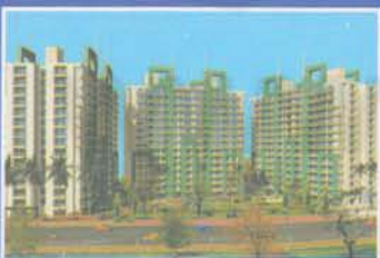
Krishna Apra Sapphire Indrapuram, Ghaziabad