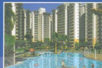
Krishna Apra Gardens, Indirapuram Ghaziabad