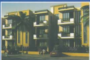
Mapsko City Homes, Sonapat