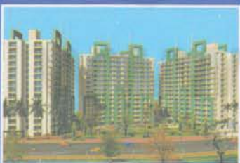
Krishna Apra Sapphire Indirapuram, Ghaziabad