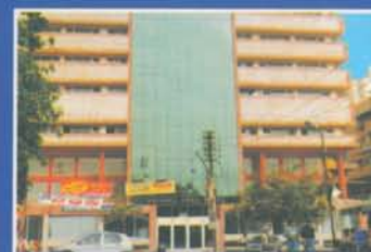
Krishna Apra Plaza, Noida