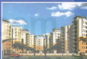
Krishna Apra Residency, Noida