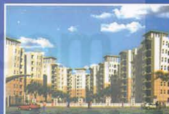
Krishna Apra Residency, Noida