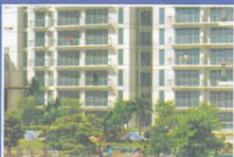
Mapsko Business Arcade, Sonapat