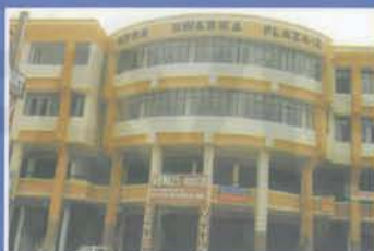
Apra Dwarka Plaza-I, Dwarka, Delhi