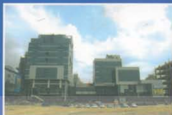
Krishna Apra Business Square Pitam Pura, New Delhi