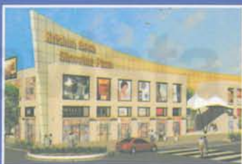
Krishna Apra Shopping Plaza Indirapuram, Ghaziabad