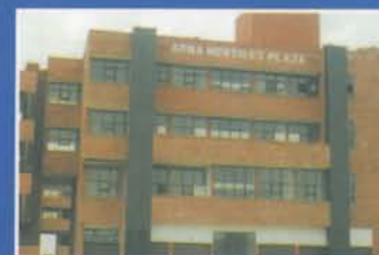
Apra North-Ex Plaza Pitam Pura, New Delhi