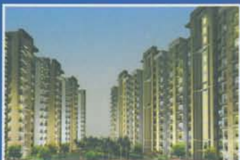
Mapsko Paradise, Gurgaon